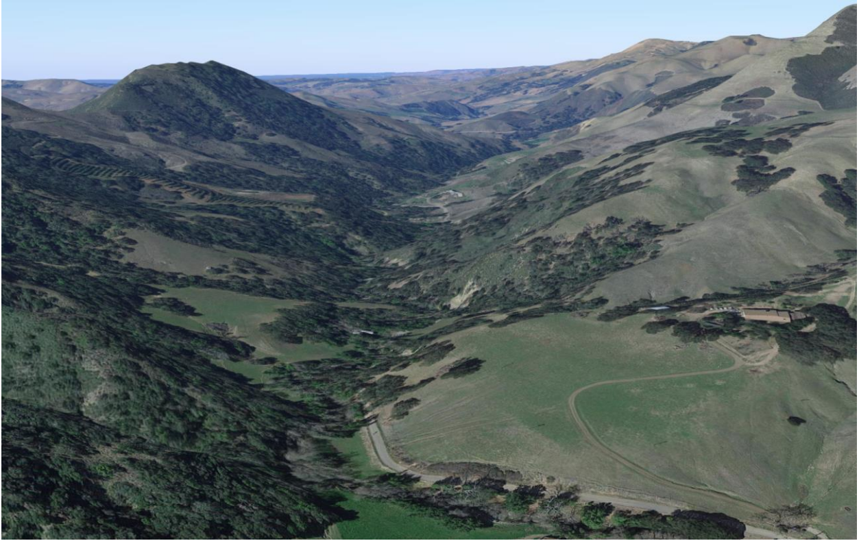
Santa Rosa Creek – Looking towards Cambria and the Pacific.